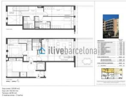
Dúplex - 1